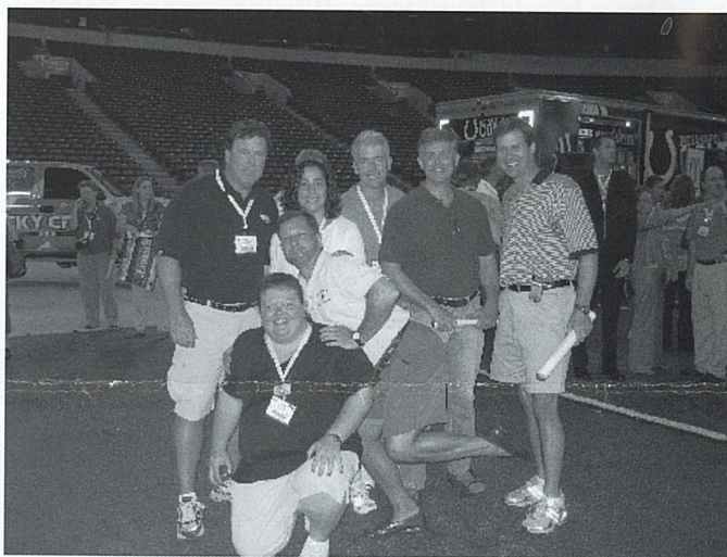
Above photo: WRAPS members at the NRPA Conference social at the RCA Dome in Indianapolis.

The singers, I can only think of one word to describe them..... Amazing!!! What a variety of talent. What diversity. We had Opera, Chinese Folk Music, Rock and Roll, Broadway, Rhythm and Blues. It wasn't just a Singing Contest!! No the Singers provide us with a workshop on healthy aging. The lesson? Stay involved. Try new possibilities. And most of all have FUN!!!!