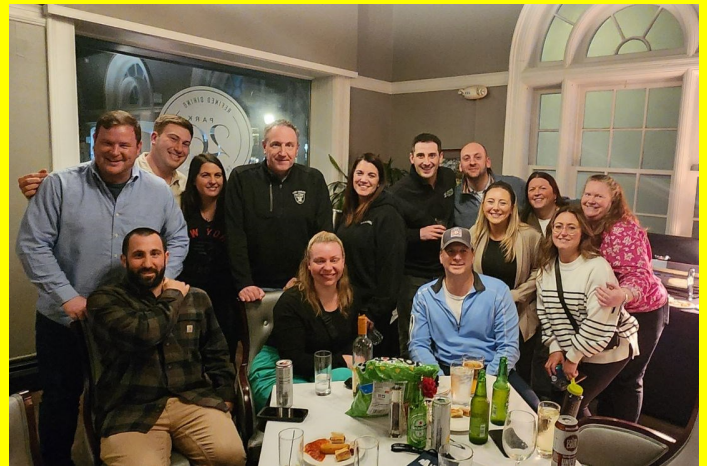
Thanks New York State Recreation & Park Society for another great conference in Queensbury NY. It was a great celebration of the amazing NY recreation professionals. We connected, learned and were re-inspired. Photo on front page is also from the conference.